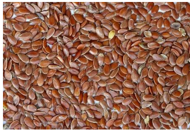
Sanjay Acharya- 2009 - Wikimedia