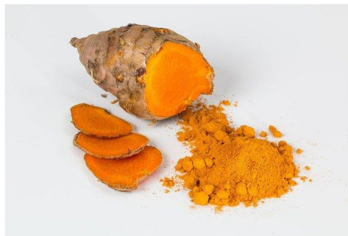
Stevepb – Pixabay - 3251560_640