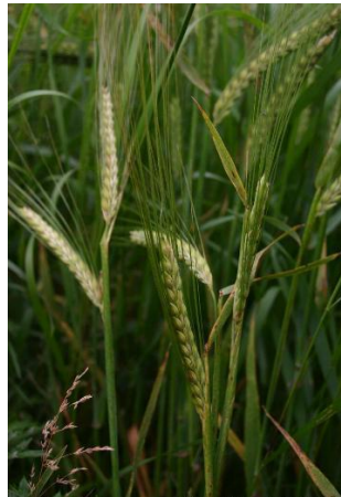
Sten – Wikipedia - 2004