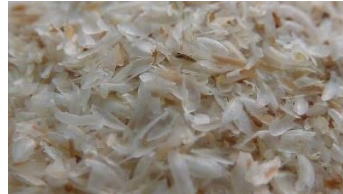
Bastique (Cary Bass) - 2010 - Wikipedia