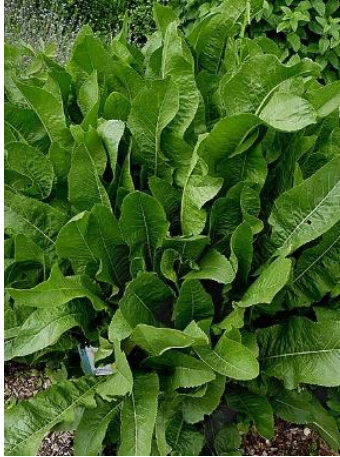
Jamain - 2011 - Wikipedia