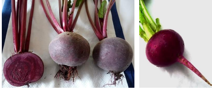
Pamsai - 2010 - Wikipedia