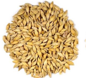
SanjayArcharya – Wikipedia - 2017